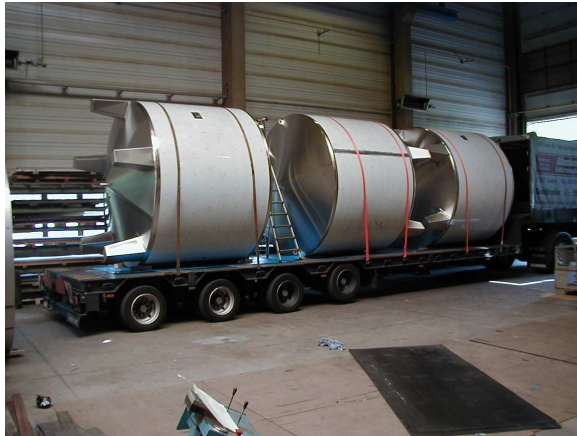
tanks with protective foil on the outer side