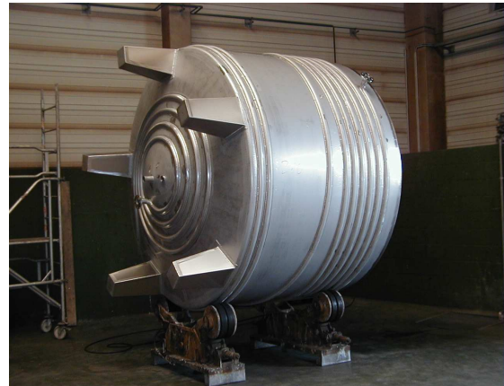
addition: halfcoils and lateral agitator flange