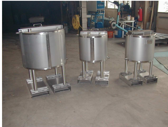
special construction on request