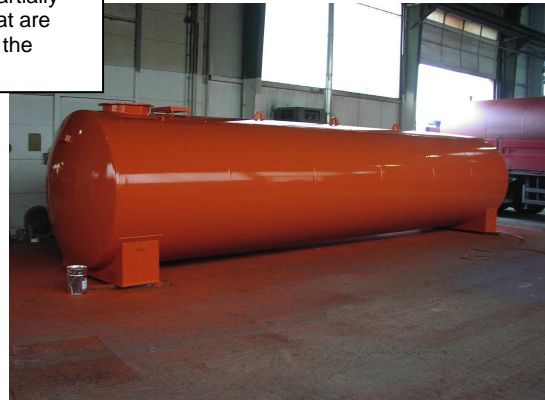
DIN 6616 for overground storage, primed on untreated surface outside

photos show partially accessories that are not included in the basic price