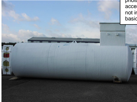
DIN 6608 for underground storage, Bitumen insulation outside

photos show partially accessories that are not included in the basic price