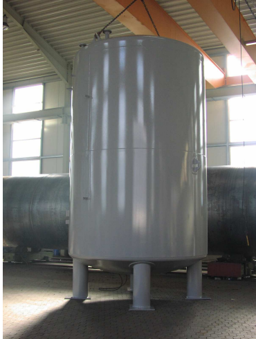
DIN 6618 for overground storage primed on untreated surface outside

photos show partially accessories that are not included in the basic price